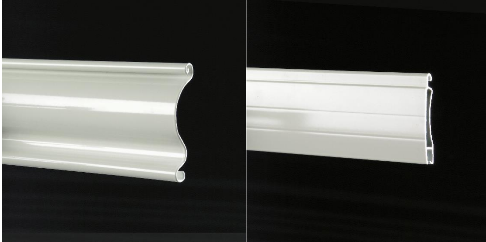
SINGLE SKIN STEEL LATH

The majority of Roller shutters are manufactured from either Steel or Aluminium. Most people think that Steel is the strongest, but this is not necessarily the case when it comes to Roller Shutters. Steel Laths are usually Single Skin, where Aluminium Laths are usually Extruded and have a Twin Wall, hence are stronger.